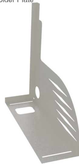
Right CPU Holder Plate