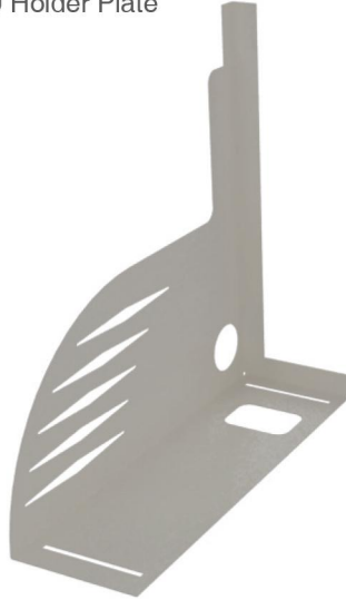
Left CPU Holder Plate