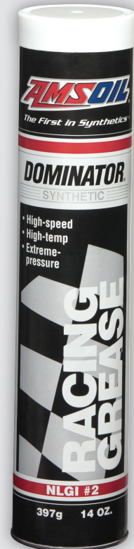
NLGI #2 GC-LB

DOMINATOR Racing Grease contains a robust package of oxidation inhibitors, helping prevent grease breakdown and component surface damage. Its excellent adhesion and cohesion properties allow it to resist water washout during operation in wet conditions. A premium blend of corrosion inhibitors further protects against corrosion formation.