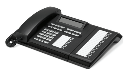
OpenStage 30 with OpenStage Key Module 15