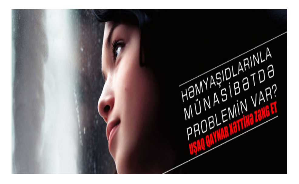
Figure 4. The Promotional Ad of Children Helpline.

available on the website. There is also a useful guide on the website to learn how to reach the required sections.