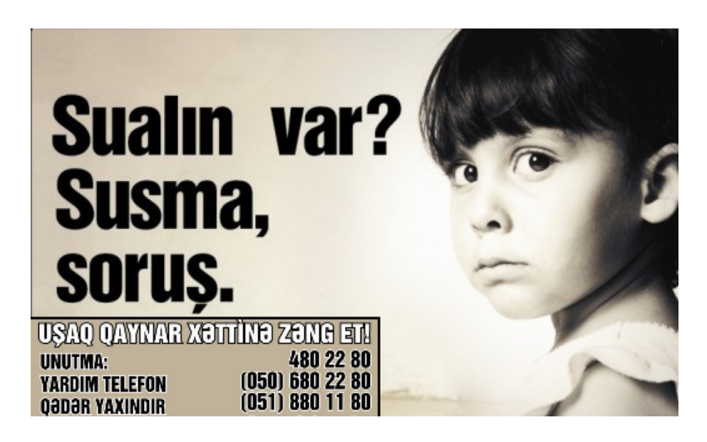
Figure 3. Promotional Ad of Children Helpline

The other campaign which is accessible to a wider audience is the "Children Helpline" project. This project has been conducted since 2010. The campaign is run by Reliable Future Youth , the non-governmental, charity organization. The project is also supported by the office of UNICEF, Save the Children, World Vision, and the Ministry of Education. The aim of the project is to provide psychological help to the children suffering from abuse, violence, and psychological problems. Four different telephone numbers can be used for the calling and the lines are open 7/24.<sup>41</sup> All the calls are toll-free. "Do you have a question? Then ask" is one of the most used slogans in the promotional ads (Figure 3).