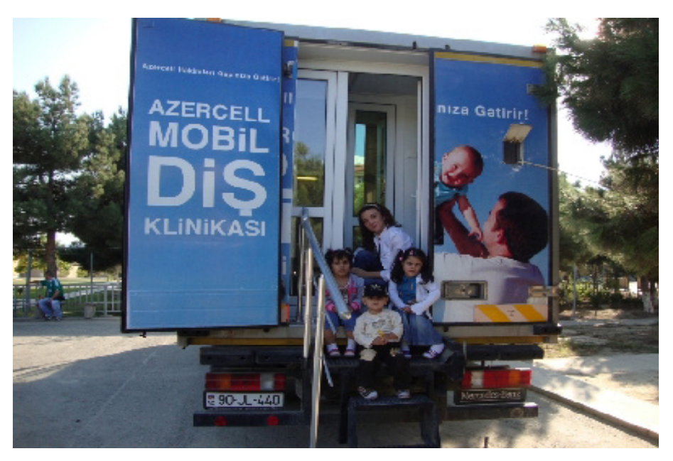
Figure 1. Mobile Dental Clinic Minibus.