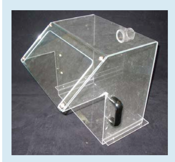
Figure 3 Ventilated bench-top enclosure