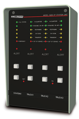
Model 6203 IP Station Transponder