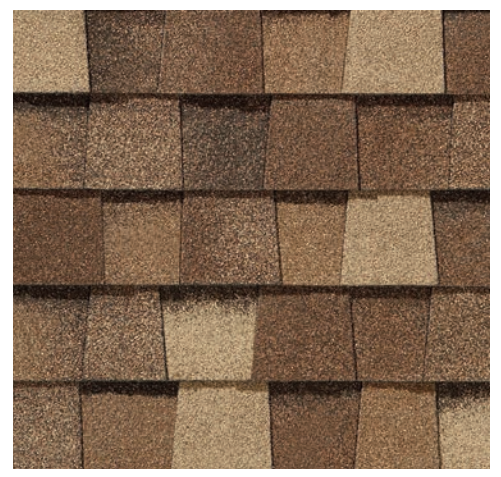
Max Def Resawn Shake