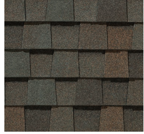
Max Def Heather Blend