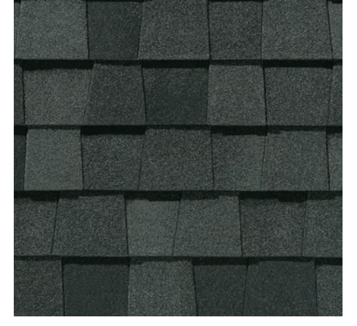
Max Def Moire Black