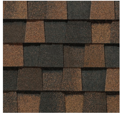
Max Def Burnt Sienna Ma