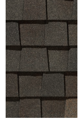
Max Def Black Walnut Moire Black