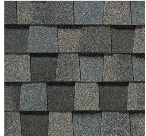
Max Def Weathered Wood