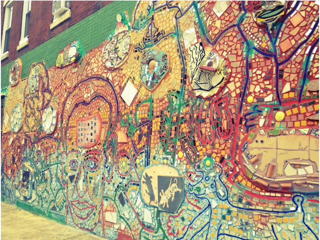
Philadelphia's Magic Gardens. This place was so cool!