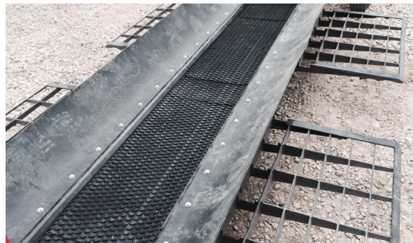
Hydraulic lift flaps make for fast spill free unloading