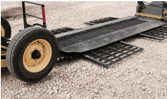
Meridian reliabelt's Low profile design keeps the deck at only 5" for even the lowest trucks