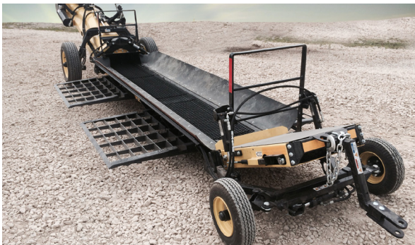
Full hydraulic mover kit available for easy moving