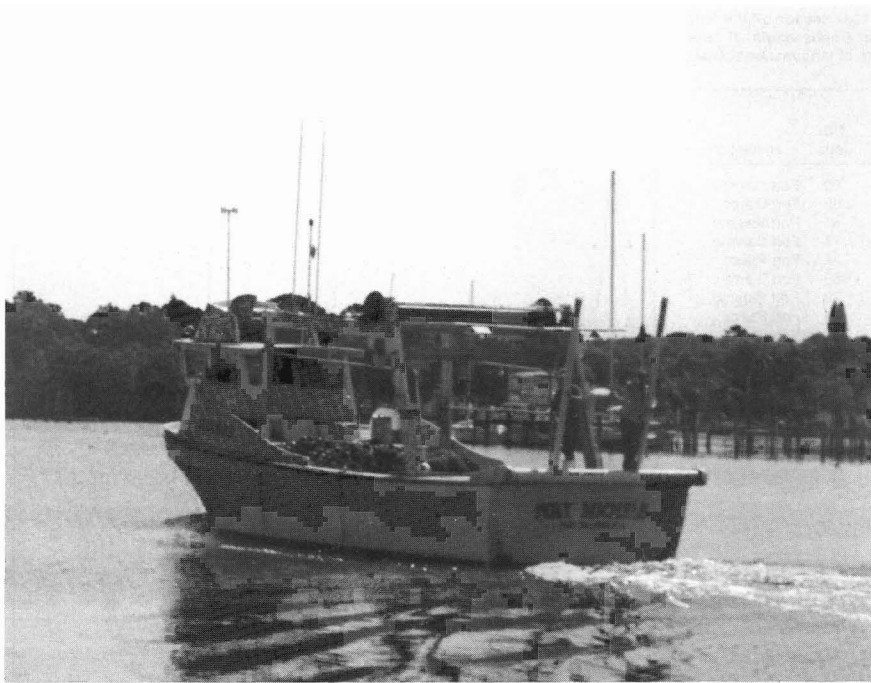
Figure 2.—A typical driftnet boat operating in the Fort Pierce-Port Salerno, Fla., area.

the entire season. Present boats are standard fiberglass run-around gillnet boats (Fig. 2) ranging from 30 to 50 feet in length (Table 1). While driftnetting, each boat is operated by a captain and a crew of two or three. The captain is not necessarily the owner of the boat.