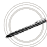
Lenovo Active Pen*