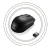
Lenovo 300 Wireless Mouse*