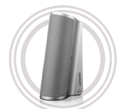
Lenovo 500 2.0 Bluetooth® Speaker