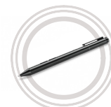
Lenovo Active Pen 2*