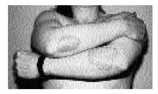
FIGURE 1. Psoriasis, like atopic dermatitis or other forms of eczema, is exacerbated by emotional stress in at least one half of patients.

Psychodermatologic disorders can be broadly classified into three categories: psychophysiologic disorders, primary psychiatric disorders and secondary psychiatric disorders.<sup>1</sup> The term "psychophysiologic disorder" refers to a skin disorder, such as eczema or psoriasis, that is worsened by emotional stress (Figure 1). "Primary psychiatric disorder" refers to a skin disorder such as trichotillomania, in which the primary problem is psychologic; the skin manifestations are self-induced. "Secondary psychiatric disorders" affect patients with significant psychologic problems that have a profoundly negative impact on their self-esteem and body image. Depression, humiliation, frustration and social