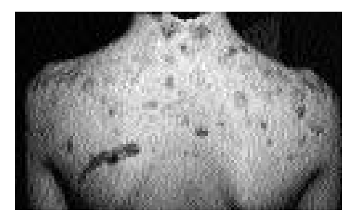
FIGURE 6. Psychologic impact of disfigurement. This student with treatment-resistant cystic acne became severely depressed and refused to go to school; he had been a top student before the onset of acne.

devastated as a result (Figure 6). Moreover, persons with skin disorders have trouble getting jobs in which appearance is important.<sup>20</sup> It is also well documented that persons with visible disfigurement face discrimination, especially if the condition is perceived to be contagious.<sup>21</sup>