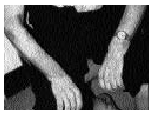
FIGURE 5. Neurotic excoriation. The patient shown in Figure 3 after successful treatment with an antidepressant. When the underlying psychopathology resolved, the patient stopped excoriating his skin.

Trichotillomania is one of the rare conditions in which pathologic examination of the