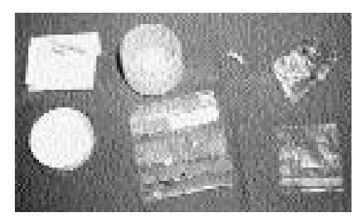
FIGURE 2. Delusions of parasitosis—the "matchbox sign." Patients with delusions of parasitosis often try to bring specimens to the physician as proof that they have an infestation.

The treatment of choice for delusions of parasitosis is an antipsychotic medication