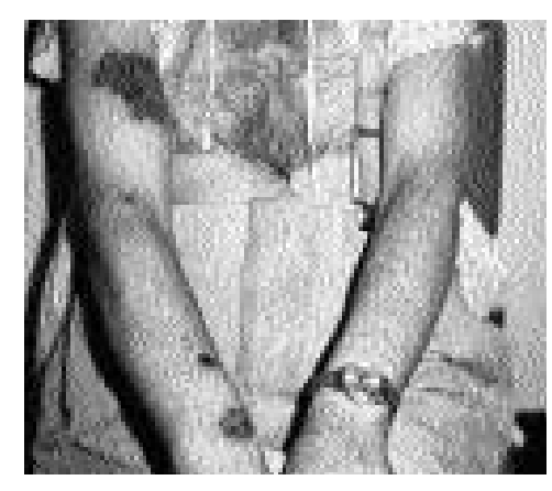
FIGURE 3. Neurotic excoriation. This man became severely depressed when a stroke paralyzed his right arm. He then used his functional arm to induce skin lesions.