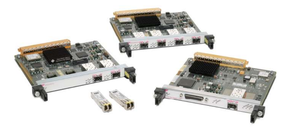
Figure 1. Cisco 2-Port OC-48c/STM-16c POS/RPR SPA with SFP Optics

The Cisco 1-, 2-, and 4-Port OC-48c/STM-16c POS/RPR SPAs are available on high-end Cisco routing platforms and offers the benefits of network scalability with lower initial costs and easy upgrades. The SPAs continues the Cisco focus on investment protection along with consistent feature support, broad interface availability, and leading-edge technology. The SPAs allow different interfaces (POS, ATM, etc.) to be deployed on the same carrier card.