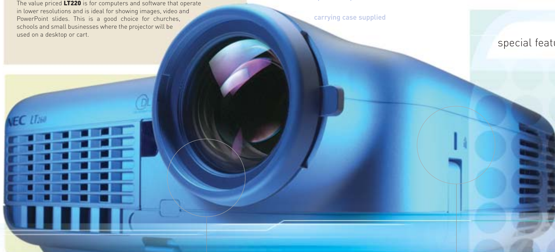
figure 1 sealed optics for use in dusty or smokey environments

We take our responsibility to the environment very seriously, especially since our products are used worldwide. We continually look for ways to improve the efficiency of our projectors with features like EcoMode™ that reduces overall projector power consumption and help conserve energy. In addition our projector factories are certified to meet the ISO environmental quality standard (ISO 14001) and are ISO9001 and ISO9002 certified.