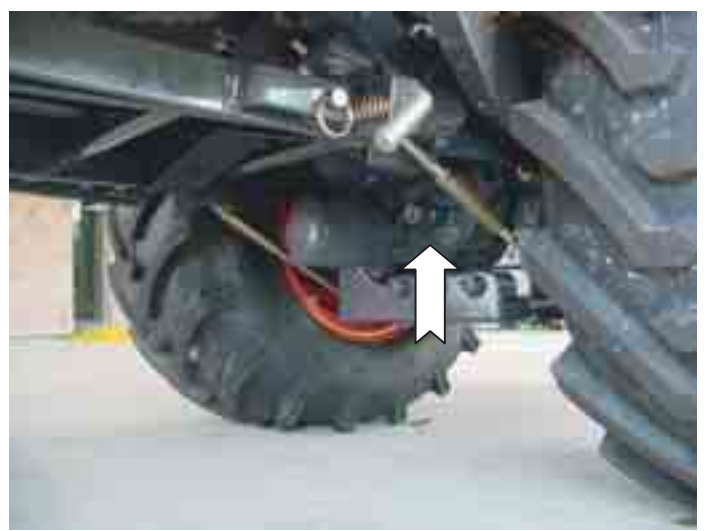
Figure 12. Mid-mount PTO shaft.

Ground-carried Decks: The decks on most larger tractors are ground carried or ground following. The linkages on these decks look very much like the suspended linkages used on smaller tractors but are not necessarily parallelogram linkages. On tractors with ground-carried decks, the linkage serves to lift the mower deck for transport and to pull the deck along while mowing; it does not carry the weight of the mower when in use. With ground-carried decks, the deck rides on gage wheels when in use. The wheels are generally much larger than the anti-scalp wheels on suspended decks and usually have pneumatic tires, not just semipneumatic tires. With ground-carried decks, you will either lift the deck all the way up into the transport position or lower the linkage all the way; you do not want to carry the mower on the linkage in use. Either the front or rear linkage (or both) will pull the mower deck along while mowing, but the mower will follow the