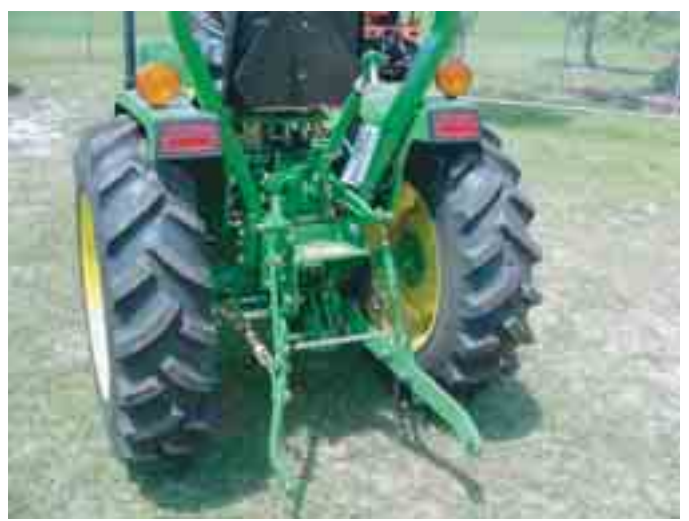
Figure 16. Three point hitch on compact tractor.