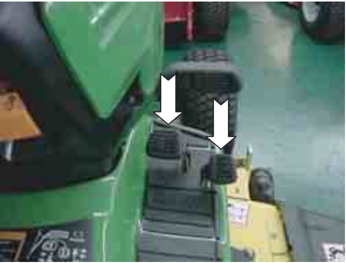
Figure 9. Pedals to operate hydrostatic transmission.

Shaft drives (Figure 11) are used on the larger, more expensive machines. Shaft drives require one or even two right angle gear boxes, as well as two universal joints. They are more expensive but will handle higher loads.