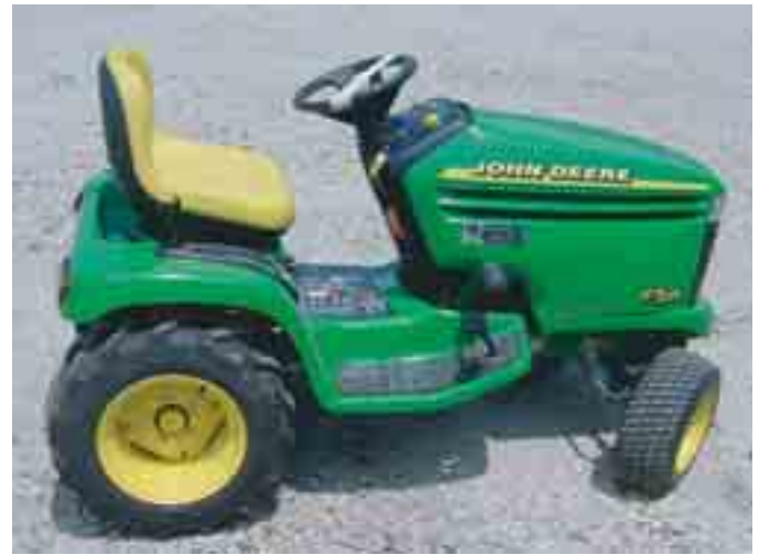
Figure 2. Lawn and garden tractor