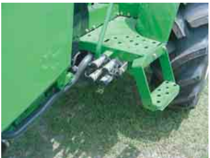
Figure 13. Remote hydraulic outlets on tractor.