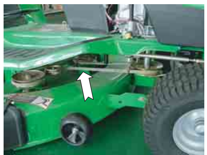
Figure 10. Belt drive to mower deck.