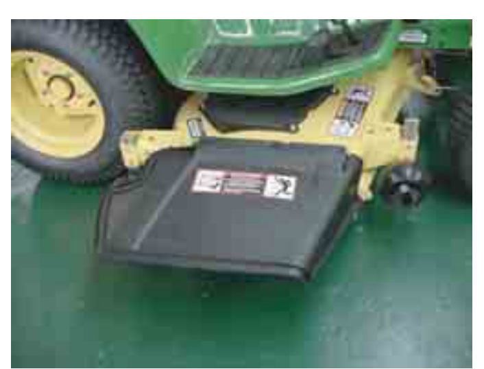
Figure 18. Discharge chute in place.

A lawn/garden tractor can be a welcome addition to your home. It can make mowing and other jobs much easier. Because there are so many options to choose from, selecting a lawn/garden tractor can be challenging. Decide what features are important to you, and find tractor models with those features. Consider quality (construction, service, parts, reliability) in your decision, and pick the machine that is the best value for you. Then, use it safely.