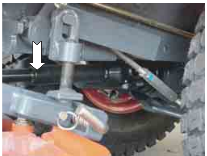
Figure 11. Shaft drive to mower deck.