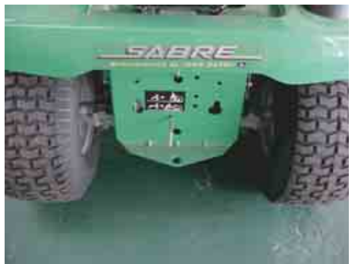
Figure 14. Drawbar hitch on lawn tractor.

Three-point hitches (Figure 16) are the top-of-theline system. They are found only on the larger garden tractors. They are nearly always actuated by hydraulics. This is the same system used on farm tractors. Garden tractors, if they have a three-point hitch, will have a category 0 hitch; compact tractors use a category 1 hitch. ASAE standards define the dimensions of the tractor hitches and matching implement components for each category. The hitches consist of two lower hitch arms that are roughly horizontal when lowered, but the outer ends of which rotate upward when the lift is raised. The third arm is not power-lifted. It is just a link fastened to the rear of the tractor and to the hitch mast on the implement. The upper link is a turnbuckle that can be screwed in or out to level the implement. Again, only three-point hitch implements can be used with this system, and category 0 and category 1 implements are