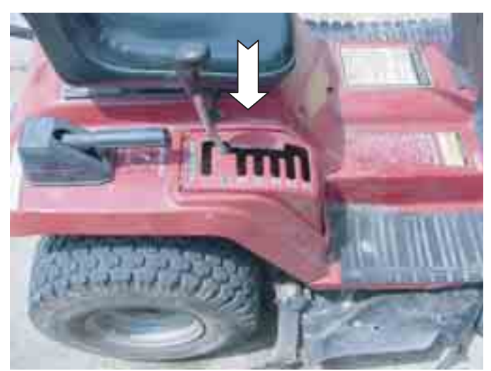
Figure 8. Gearshift lever on gear transmission on lawn tractor.