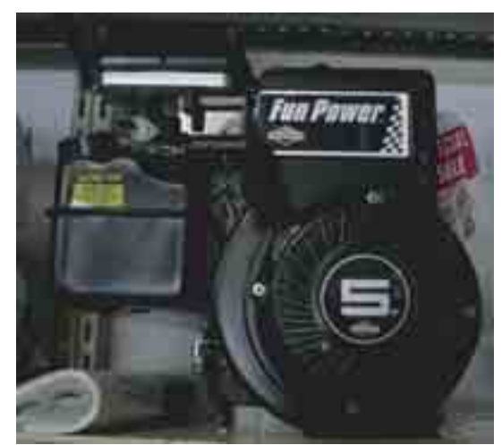
Figure 5. Rear view of horizontal-shaft engine.