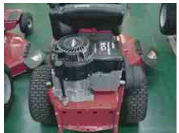
Figure 4. Vertical-shaft engine.