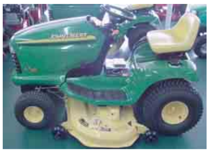
Figure 1. Lawn tractor

purpose lawn and garden work, but their primary purpose is lawn mowing. They generally have larger engines, bigger tires and all implements, including the mower deck, are readily removable from the tractor. Tractors in this class must provide a means of lifting an implement, but it may be a manual lift. Implements suitable for use with this class, in addition to centermounted mower decks, include plows, tillers, cultivators, sweepers, dozer blades and snow blowers. Mower decks up to 54 inches are usually available.