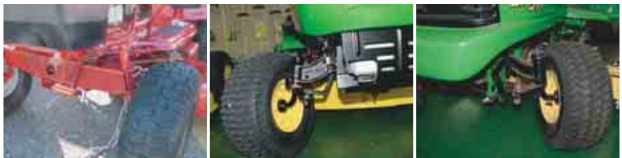
Figure 17. Formed and welded front axle on cheap tractor on the left; cast iron front axle on small lawn tractor in the center, forged front axle on higher quality tractor on the right.

Service should be a consideration. The less expensive machines typically have a shorter warranty, and getting repairs done under warranty may be difficult; dealers and manufacturers tend to stand behind the more expensive machines.