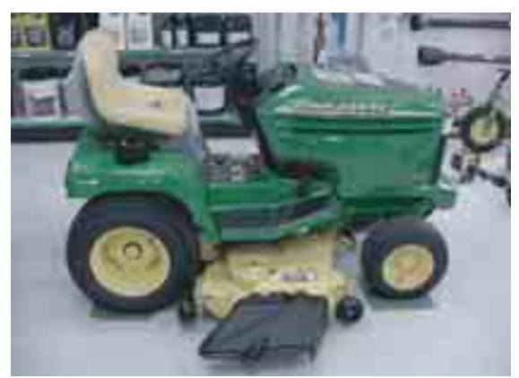
Figure 3. Garden tractor

Air- or Water-Cooled: Small, low-power engines are air-cooled. The engine block has cooling fins over which a