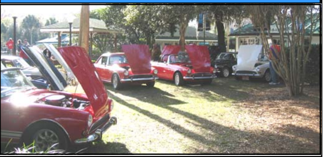
So, what's with the Triumphs trying to sneak into a Sunbeam Photo shoot?