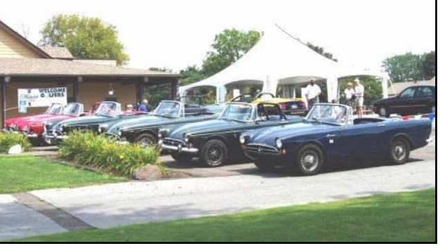
The Sunbeams attracted a lot of attention, especially from the golfers at the course.

We had no car problems during the day and, as far as I know, everyone safely found their way home.