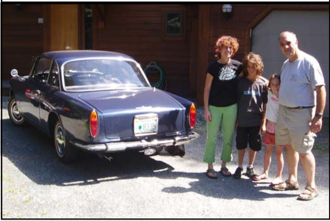
The Reina family with their new acquisition