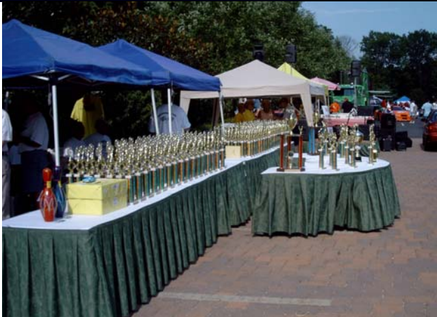
The trophy table at the Two Kids Foundation car show. See page 10

If you can't find it here it doesn't exist