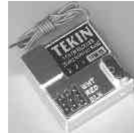
FM Chrome Micro Receiver