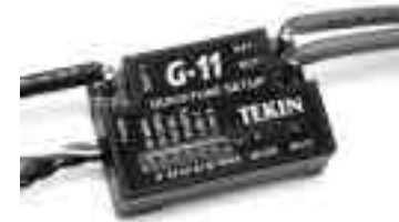
G-10, G-11 speed control