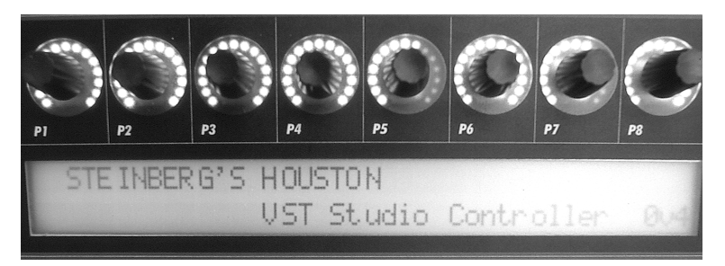
The Control Strip

The Control Strip consists of an LC display and – above it – eight dials, both located on Houston's upper left side.