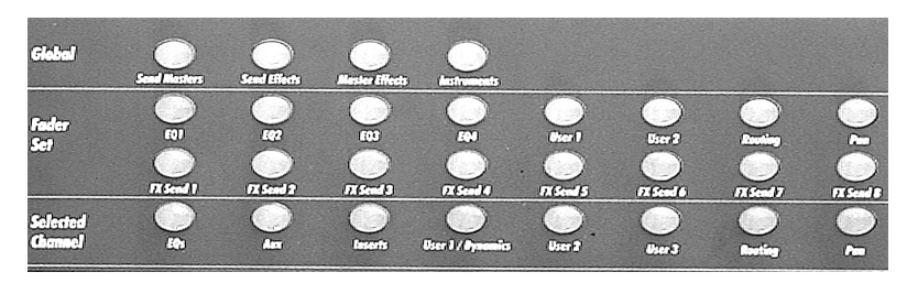
The Function Matrix

The Function Matrix consist of many buttons and is subdivided into three sections. It is located above the Control Strip.