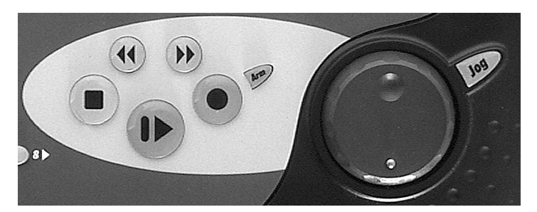
The Transport controls and the Jog Dial

The Transport controls double up for the Transport controls in your host application and the Jog Dial is used to quickly change the Song Position.