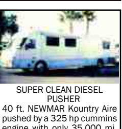
SUPER CLEAN DIESEL PUSHER 40 ft. NEWMAR Country Aire pushed by a 325 hp cummins engine with only 35,000 mi. Custom built at the factory in 1998. Truly one of a kind with many of the little things that are really needed like extra cabinets, etc. NEW tires, batteries, all engine belts, refrigerator, mattress and completely gone through mechanically and functionally. 22 ft. Add-a-room to compliment the 14 ft. slide-out, washer/dryer, Corian counter tops, tile floors. Extra freezer in a slide-out bay and many more neat things like a crystal chandelier. Reduced to $54,000 or best offer. Call (928)342-1212 for more info.