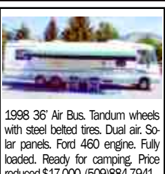
1998 36' Air Bus. Tandem wheels with steel belted tires. Dual air. Solar panels. Ford 460 engine. Fully loaded. Ready for camping. Price reduced $17,000. (509)884-7941