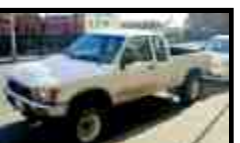
1990 Toyota 5-speed 4x4, runs good, everything works good, has bed liner & trailer hitch, set of extra wheels, $4,500. (509)782-1010