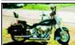
2005 Heritage Softail. 88 cu. in. engine. Only 10,000 miles. Have all receipts of work done. $13,000/offer. (509)415-1093 or (253)961-0426