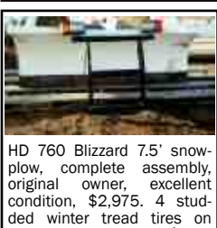
HD 760 Blizzard 7.5' snowplow, complete assembly, original owner, excellent condition, $2,975. 4 studded winter tread tires on Chrome Dodge wheels, $275. (509)860-3601