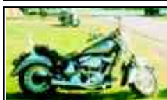
2002 Indian Spirit. S.S. motor, all original. $6,800 or best offer. (509)415-1093 or (253)961-0426