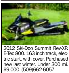
2012 Ski-Doo Summit Rev-XP. E-Tec 800. 163 inch track, electric start, with cover. Purchased new last winter. Under 300 mi. $9,000. (509)662-6057