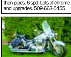
Great Bike! There is plenty of summer left to enjoy riding and this would be just the bike to help you do that. 2006 Honda VTX 1300S has 18,179 miles and many extras - Mustang seats, Cobra pipes, crash bars, heated handgrips, saddlebags, extra driving lights and many more. Excellent condition! Runs great! $6,250. Please call 509-664-3756 or e-mail if you have questions or would like to see it.