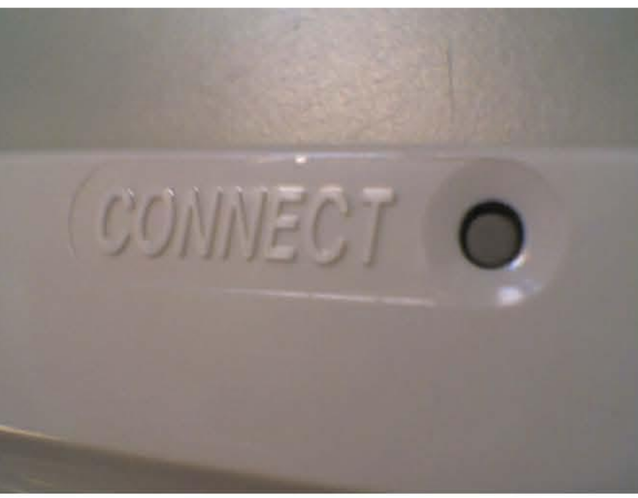
Fig. 2 Keyboard backside