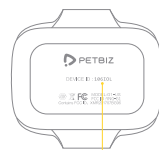
Device ID (on back of device)