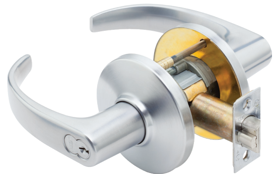
BEST 9K Series Heavy Duty Cylindrical Locks

Depending on the microbe type, Agion's antimicrobial technology has been shown to initially reduce microbial population within minutes to hours while maintaining optimal performance for years.