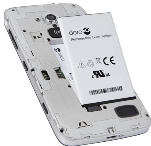
EN: Insert the battery and replace the battery cover