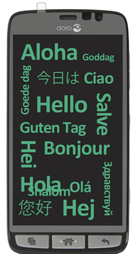
EN: Follow the instructions in the setup assistant to activate your device and set it up.