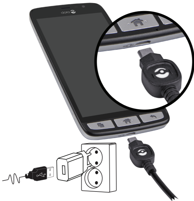
EN: Charge the phone