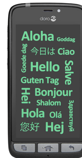
EN: Follow the instructions in the setup assistant to activate your device and set it up.