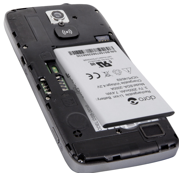
EN: Insert the battery and replace the battery cover