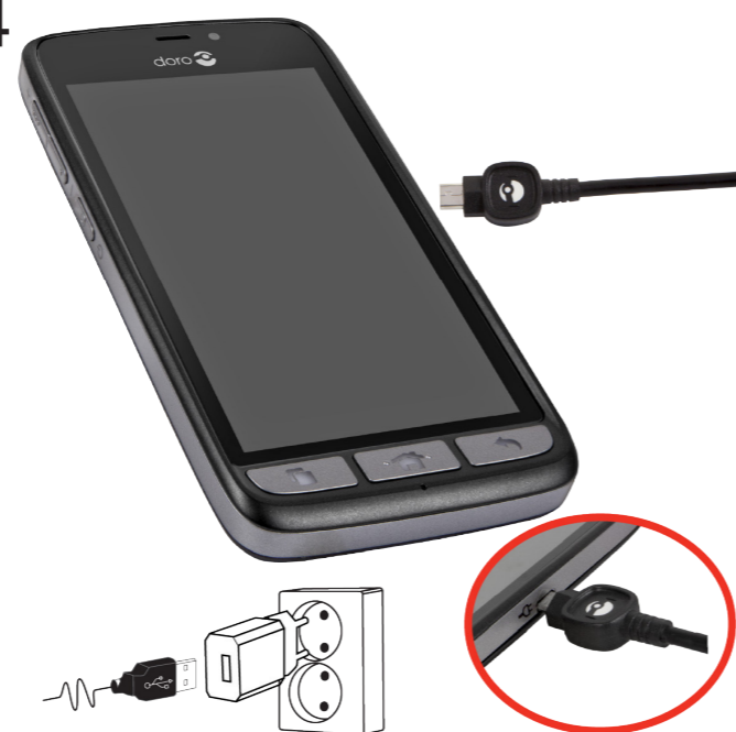
EN: Charge the phone