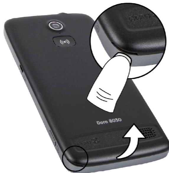
EN: Remove battery cover