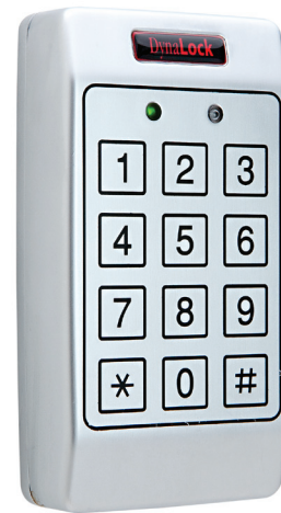
Vandal-Resistant Piezoelectric Keypad

Capacity: 500 users, single/dual code for each Keypad: 3x4 keys for local programming and 4 to 8 digit PIN code entry User Levels: Normal/Secure/Master