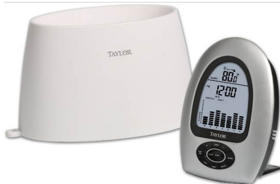
Rain Collector/Remote Sensor Base Unit