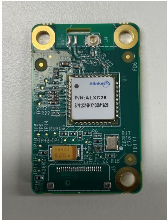
Figure 1 ALXC28 wifi module

ALXC28 is a small size, low power consumption, dual band IEEE802.11 a/b/g/n WLAN module. It can provide network connection through SDIO, UART, SPI, PCM and other interfaces. The ALXC28 ,highly integrates MAC, Base band, RF, RF front end.