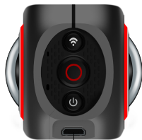
Micro USB Port