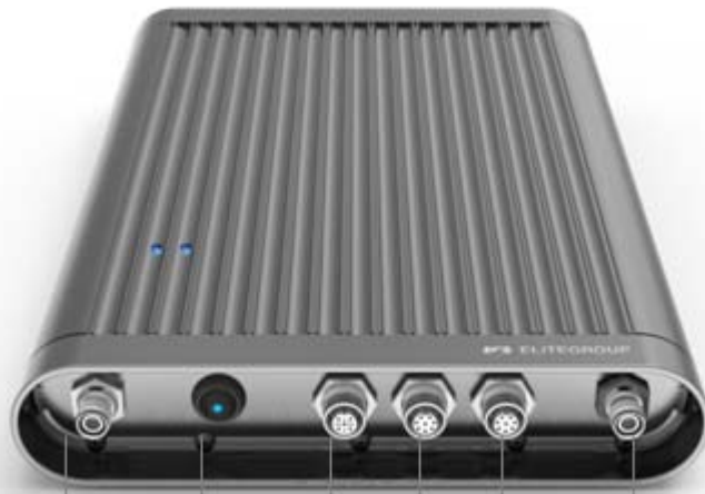
Antenna+ Power+ VGA+ RJ45+ RJ45+ Antenna+