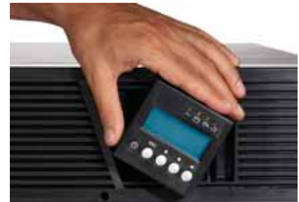
LCD rotatable display

Choice of connectivity options. Connectivity options are available for almost any networking environment. The standard unit comes with USB and RS-232 serial communication ports and a DB-9 dry contact port. You can customize your UPS by adding MS-slot interface options for other types of communications.