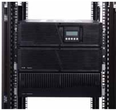
Rack model and EBM installation