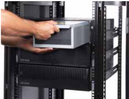
Hot swappable batteries