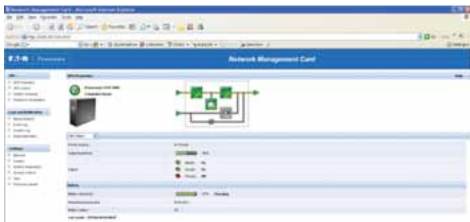
ConnectUPS-MS Network Management Card web interface

With a wide range of acceptable input voltages, this UPS does not depend on batteries to smooth out power fluctuations. Batteries are conserved for those times when utility power is highly unstable or completely out. If an outage occurs, the 9135 transfers to battery with no break in power, making this an ideal UPS for equipment sensitive to voltage fluctuations.