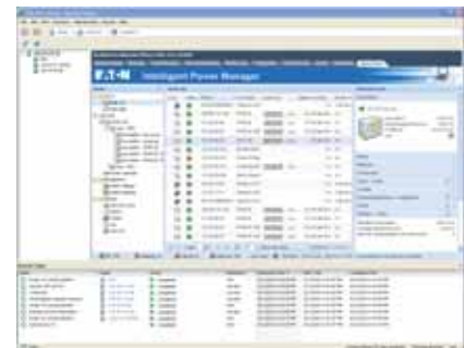
Intelligent Power Manager (IPM)