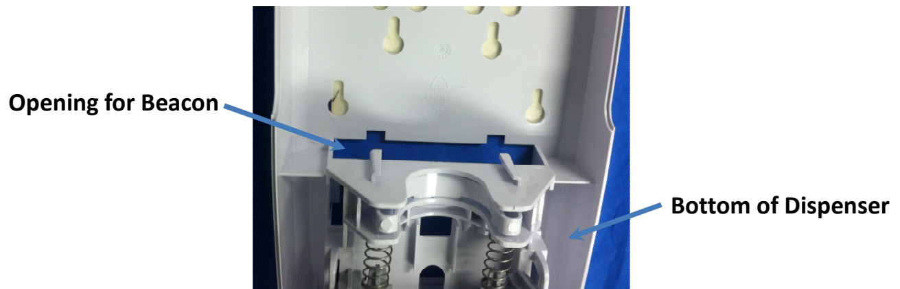
Figure 4. Interior view showing beacon installation opening and Nexa Manual Dispenser (Interior View)