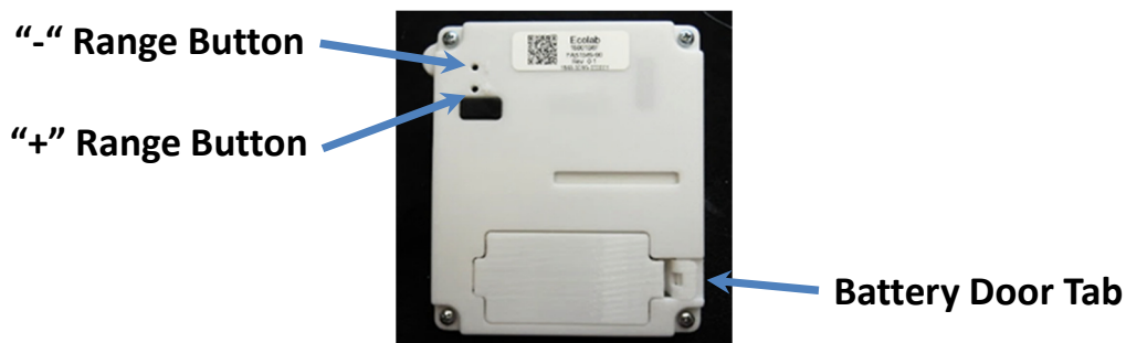
Figure 2. Back view, showing, battery door tab, and range button locations