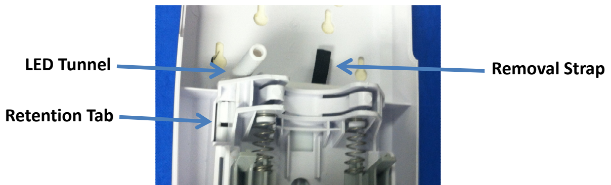
Figure 5. Beacon Installed in Dispenser