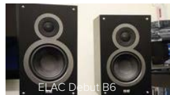
ELAC Debut B6

THE GOOD / The ELAC Uni-Fi UB5 loudspeakers offer the best performance of any speaker we've seen for the money. They deliver deep, tight bass; an effortless midrange and sweet highs. The soundstage is wide and unexpectedly deep.