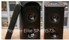
Pioneer Elite SP-FBS73-LR