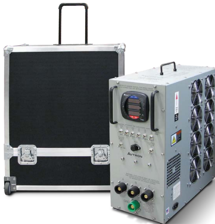
LPC100 100 KW Ultra-Compact, Portable Avtron Load Bank with transport case.

An integral control panel is provided for load bank operation and includes the necessary controls and status indicators. The load bank also includes the Avtron Advanced Digital Monitoring System (ADMS) ™ as a standard feature. The ADMS meter provides faceplate digital display of Volts, Amps, Frequency, and KW. Data Logging Software (included at no additional cost) allows Real Time Data Acquisition and trending of all meter parameters from your Laptop PC or PDA. An Infrared/USB interface cable is included for "Plug and Play" convenience.