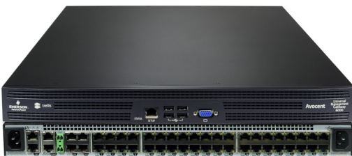
Avocent® Universal Management Gateway 6000

The Avocent® Universal Management Gateway appliance is the first converged management appliance that enables customers to remotely manage any device, in any location, from any vendor, at any time in a secure, centralized manner.