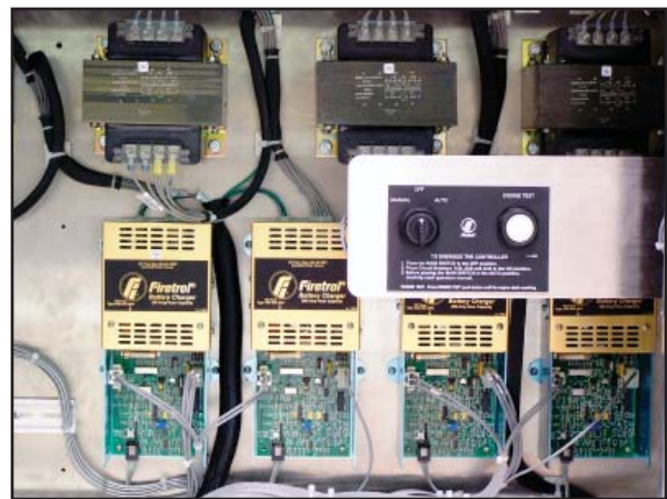
Optional 4-Charger, 20 Amp configuration

When required, the controller can optionally be supplied with a 20 Amp charging circuit. This is accomplished by supplying 4 battery chargers in parallel sets. The synchronization of the chargers is accomplished by utilizing our unique Charger Link module.