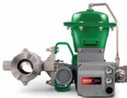
Flangeless body provides a multiclass rating.