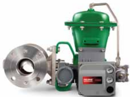
Flanged body design with a Class 150 or Class 300 rating.