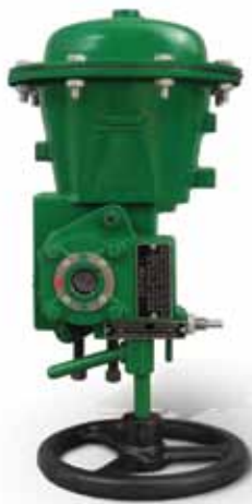
Declutchable manual operator mounts directly to the actuator.