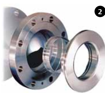
HD metal seal fights off scale and sludge buildup; inspects and replaces easily since it requires no adjustment.