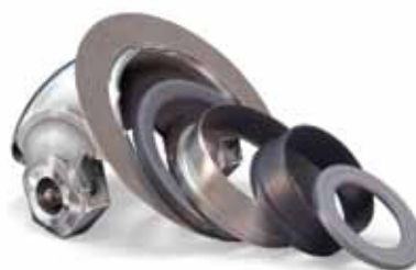
Vee-Ball seal types shown include Flat Metal, TCM (composition), and HD.