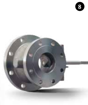
ENVIRO-SEAL® packing, which is available in all Vee-Ball valves, helps meet stringent emission control requirements.