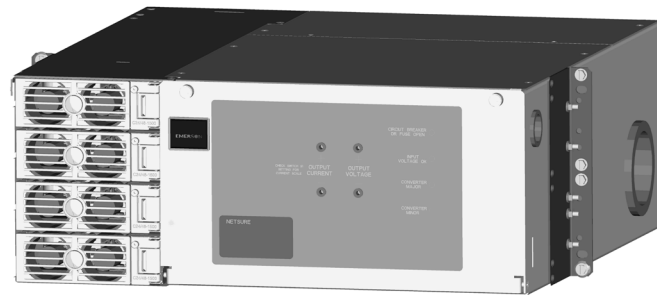
DC-DC Converter Shelf

Compact, cost effective, modular design, ideal for +24 VDC applications requiring -48 VDC output.