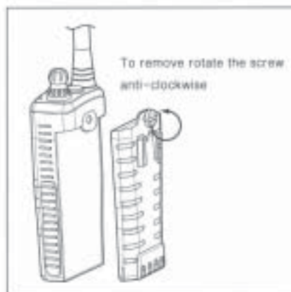
Figure 5. Battery removal / Installation