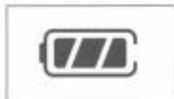
Figure 6. Battery Indicator

For your safety and convenience your transceiver continually monitors the battery pack and gives an indication on the LCD: