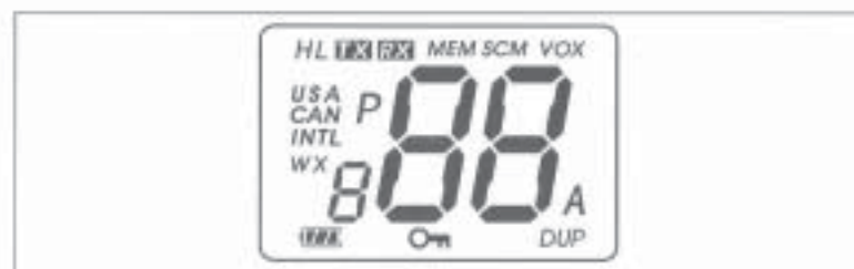
Figure 3. LCD indications