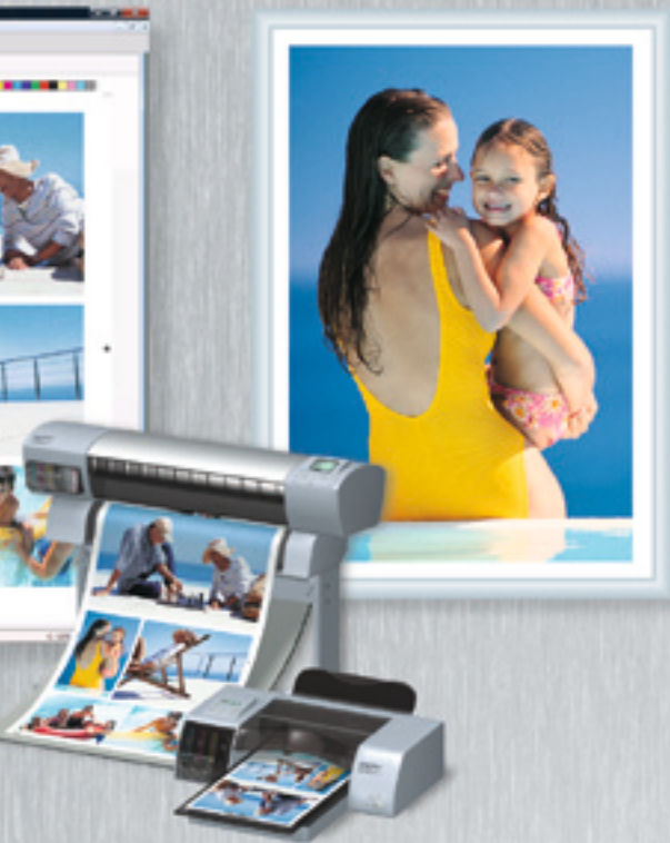
Special Package Prints

Special "Positioning & Arranging": A perfect presentation is half the battle. In Container guide lines and an alignment function make it easy to perfectly position your motif. Regardless of whether you place it manually or center it with a click or two of the mouse.