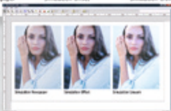
Special Print Simulation