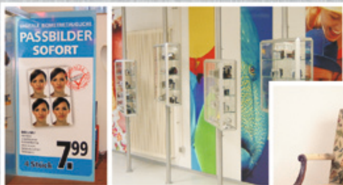
Advertising display materials - photo dose GmbH

"... As Europe's market leader in industrial photo finishing, we supply more than 60,000 partners in 19 countries with thousands of developed color photos, photo and digital prints on such different media as paper, canvas or film every day. The only way to do that is to use highly automated mass production with cutting-edge technology like the ColorGATE PHOTOGATE 5 PRO in combination with the Epson Stylus Pro 9800. PHOTOGATE 5 has found the optimal solution for handling, color management and flexibility."