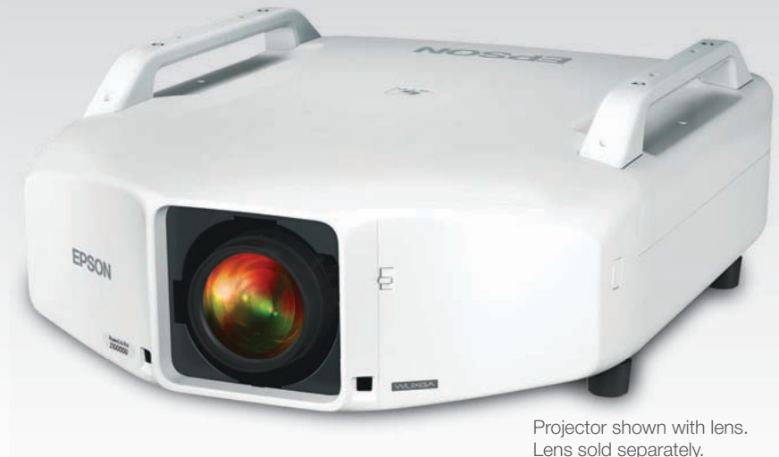
Projector shown with lens. Lens sold separately.