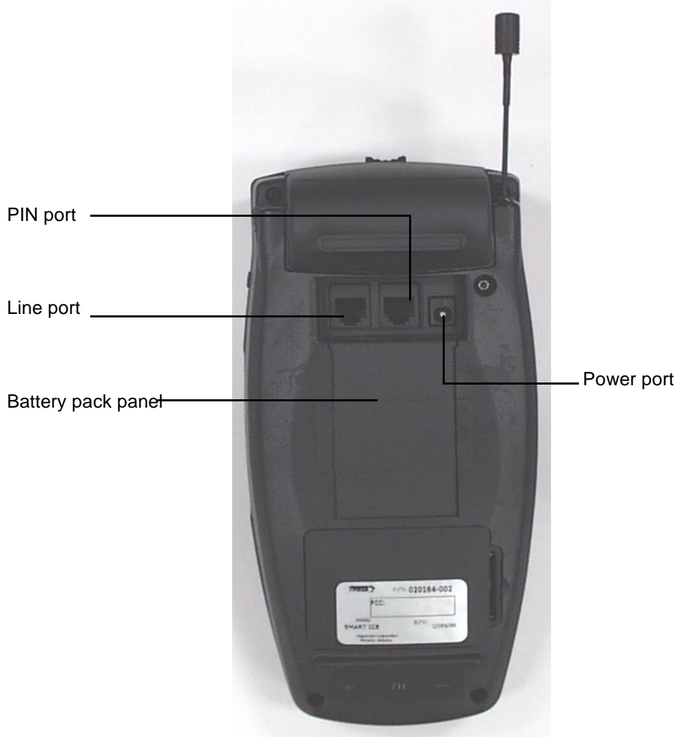
Figure 2-1. SmartICE under panel connectors

The SmartICE under panel connectors include power, PIN, and line ports.