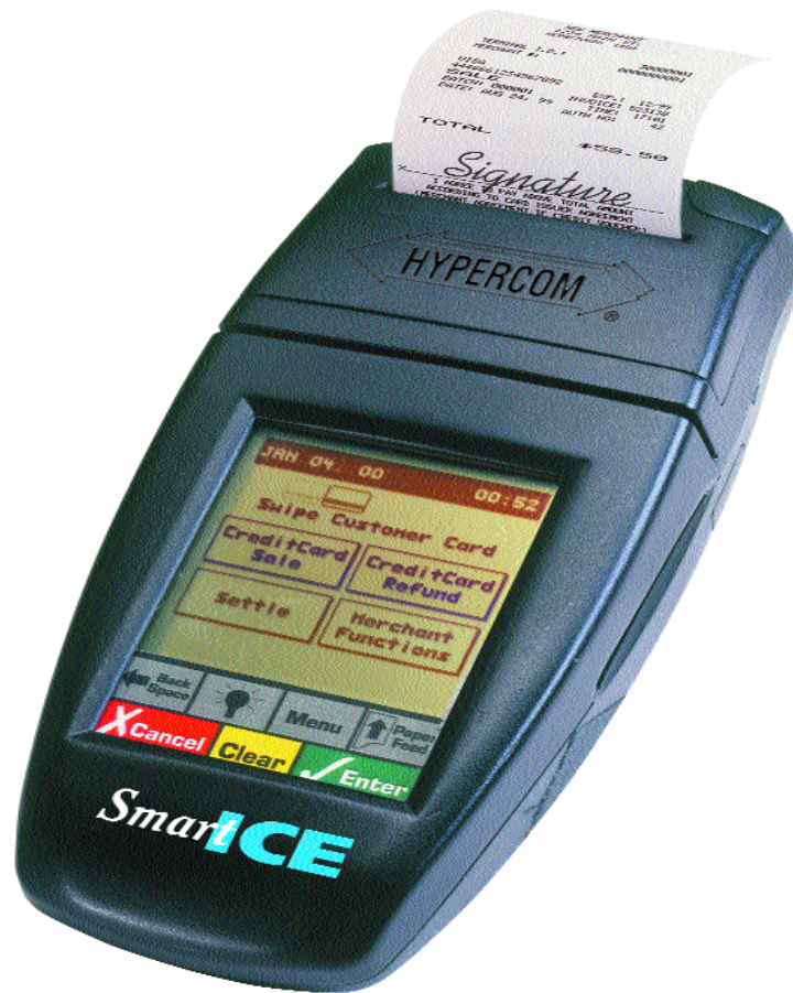
Figure 1-1. SmartICE terminal