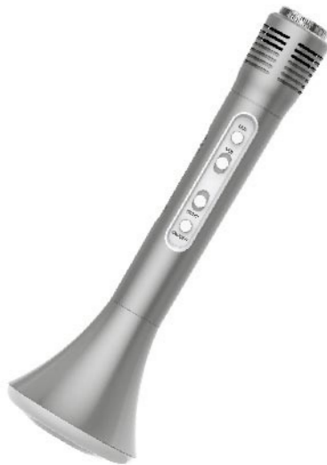
Bluetooth speaker with Microphone 1B110BT