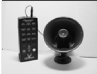
Pro Series Wired