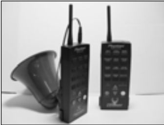
Pro Series Wireless