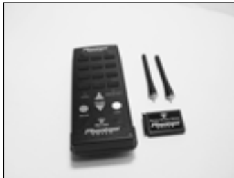
Wireless Remote Upgrade Kit

The “ Leader of the Pack ” has done it again with the all new Phantom Pro-Series . This new series of Digital Calls boast the same original features with some new exciting and innovative features: