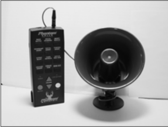
Pro-Series Wired Call

All this Along with the Same Original Features that have made Phantom Calls the Choice for Serious Sportsman: