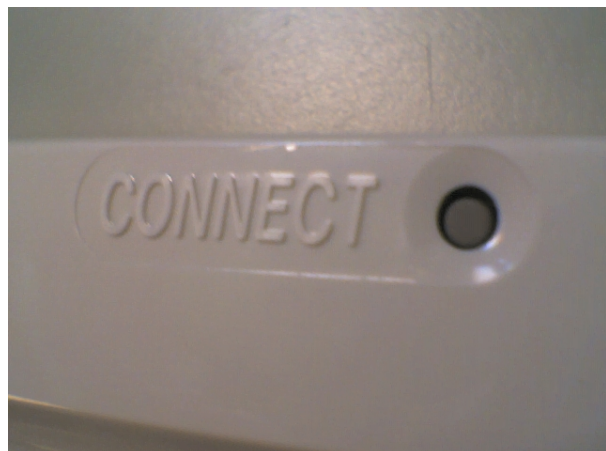
Fig. 2 Keyboard backside