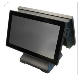
14.1 inch 16:9 LCD customer display