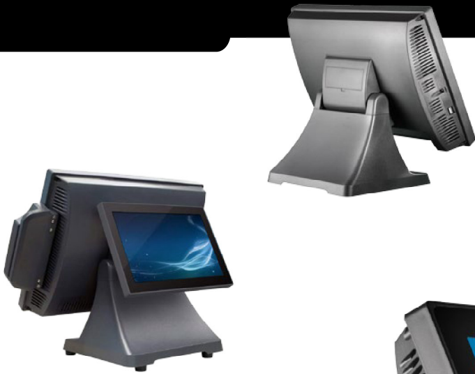
Dual screen system