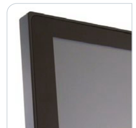
Zero edge bezel