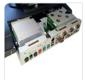
Slide in / out mother board

Specifications are subject to change without notice - © AURES 2016