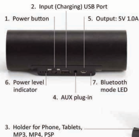
Figure – 1