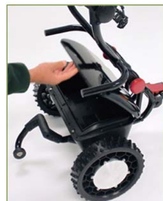
7. Lift battery cover