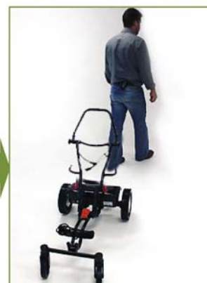
10. Clip handset to your belt, exposed, and let the CaddyTrek follow you.

*For best results, charge battery fully and do not cover the handset with clothing; stand directly behind the CaddyTrek to initialize handset.