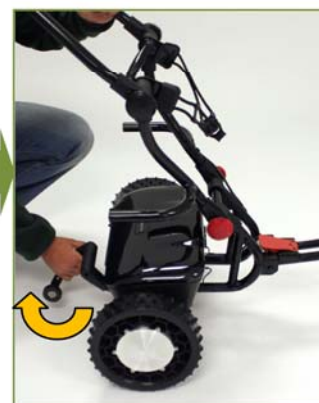
6. Extend 5 th wheel (optional for enhancing balance)