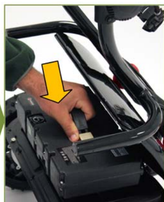
8. Insert battery and push down into place.