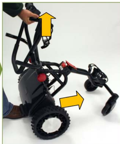
3. Place foot under base and raise handles. Wheels will move forward.