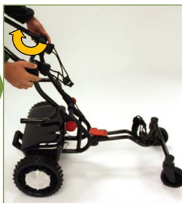
5. Loosen black knobs to position push-handle. Tighten all knobs.