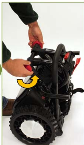
2. Loosen red knobs