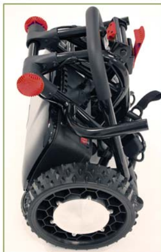
1. Place on flat surface