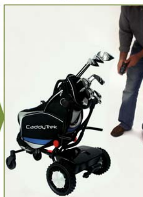
9. Power on the cart and handset to initialize*