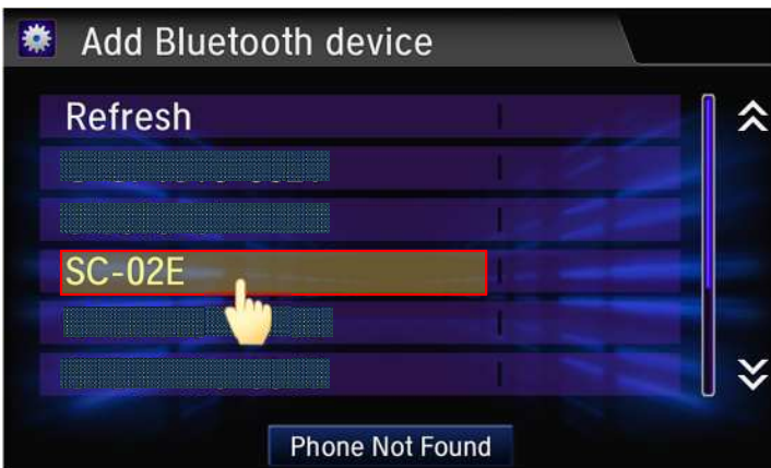
Touch your device.