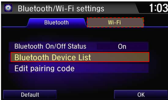
Touch Bluetooth Device List button.

When you want to connect Wi-Fi, touch Wi-Fi Network List button.