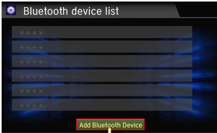
Touch Add Bluetooth Device button.