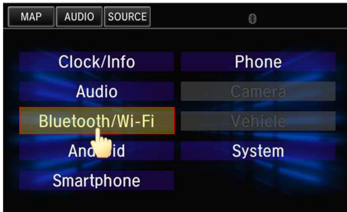
Touch Bluetooth/Wi-Fi button.