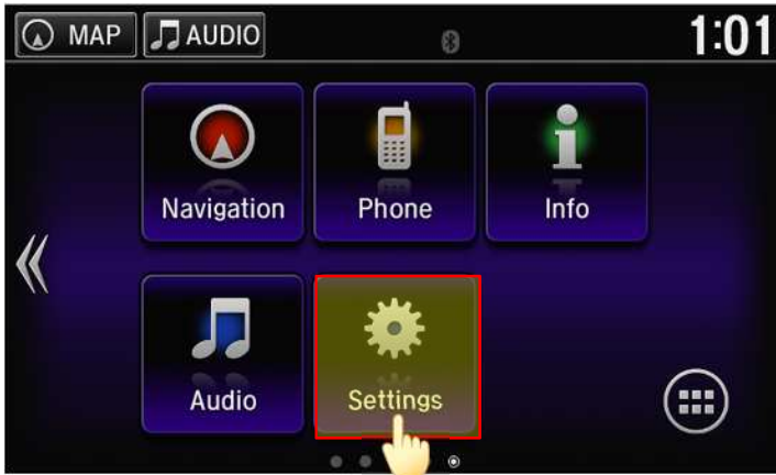
Touch Setting button.