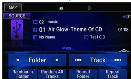
Ex.: USB Audio play screen