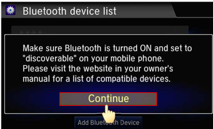
Touch Continue button.