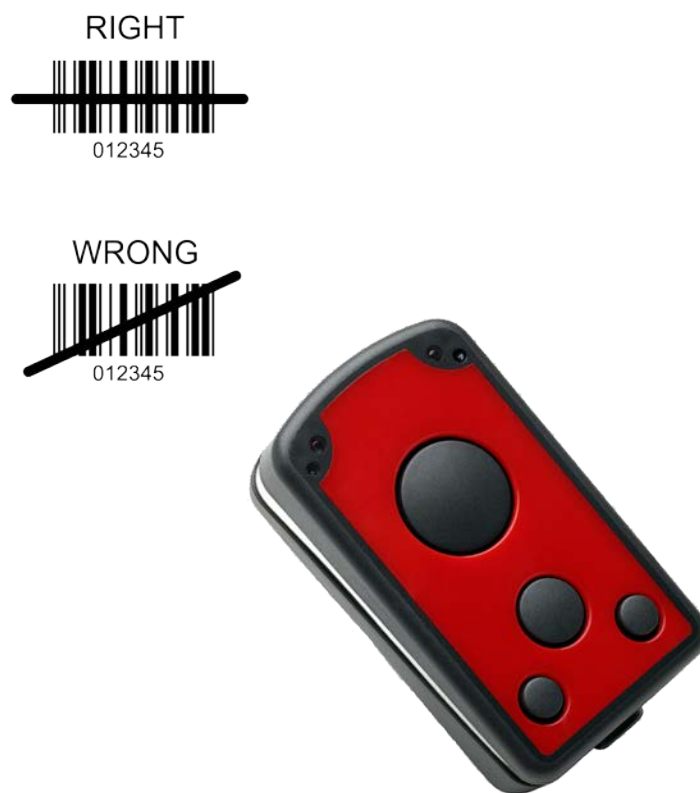
Fig. 2: Barcode Scanner Alignment