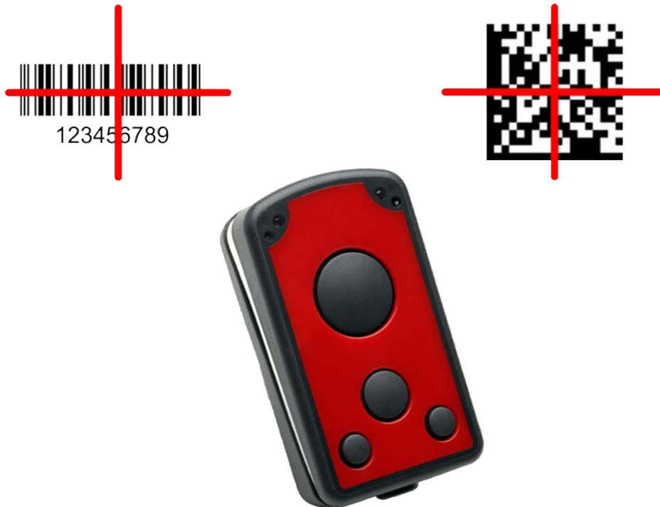
Fig. 3: Scan Example 1D/2D Imager